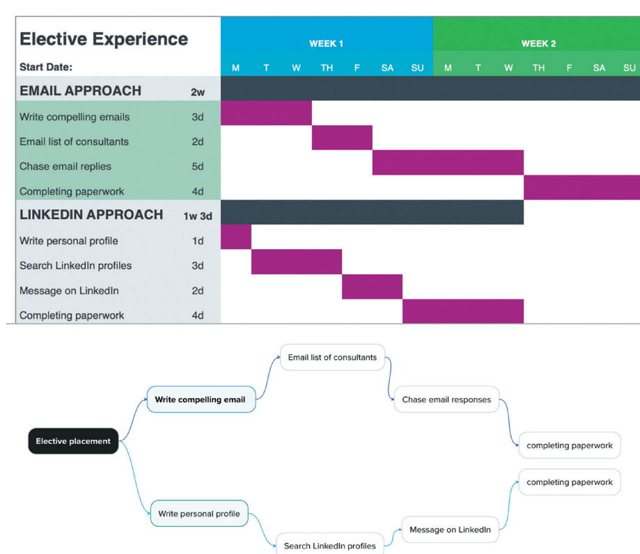
Figure 2. (Above) Gantt chart showing temporal timeline in planning both email and LinkedIn approaches to scheduling an elective placement. (Below) A mind map showing sequential steps in planning both email and LinkedIn approaches to scheduling an elective placement